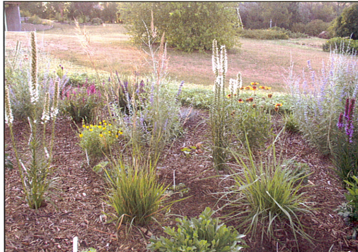
Figure 5. For much of the summer in the Great Plains, a rain garden might be the only "green" area in a non-irrigated yard.

Use potted or bare root plants rather than seeds. Plant from April to September. Place the more water tolerant species near the bottom, and drought tolerant near the edges. Plant spacing will vary depending upon species and desired appearance. Generally, 15-18 inches between plants is adequate. Consider mature size when spacing plants.