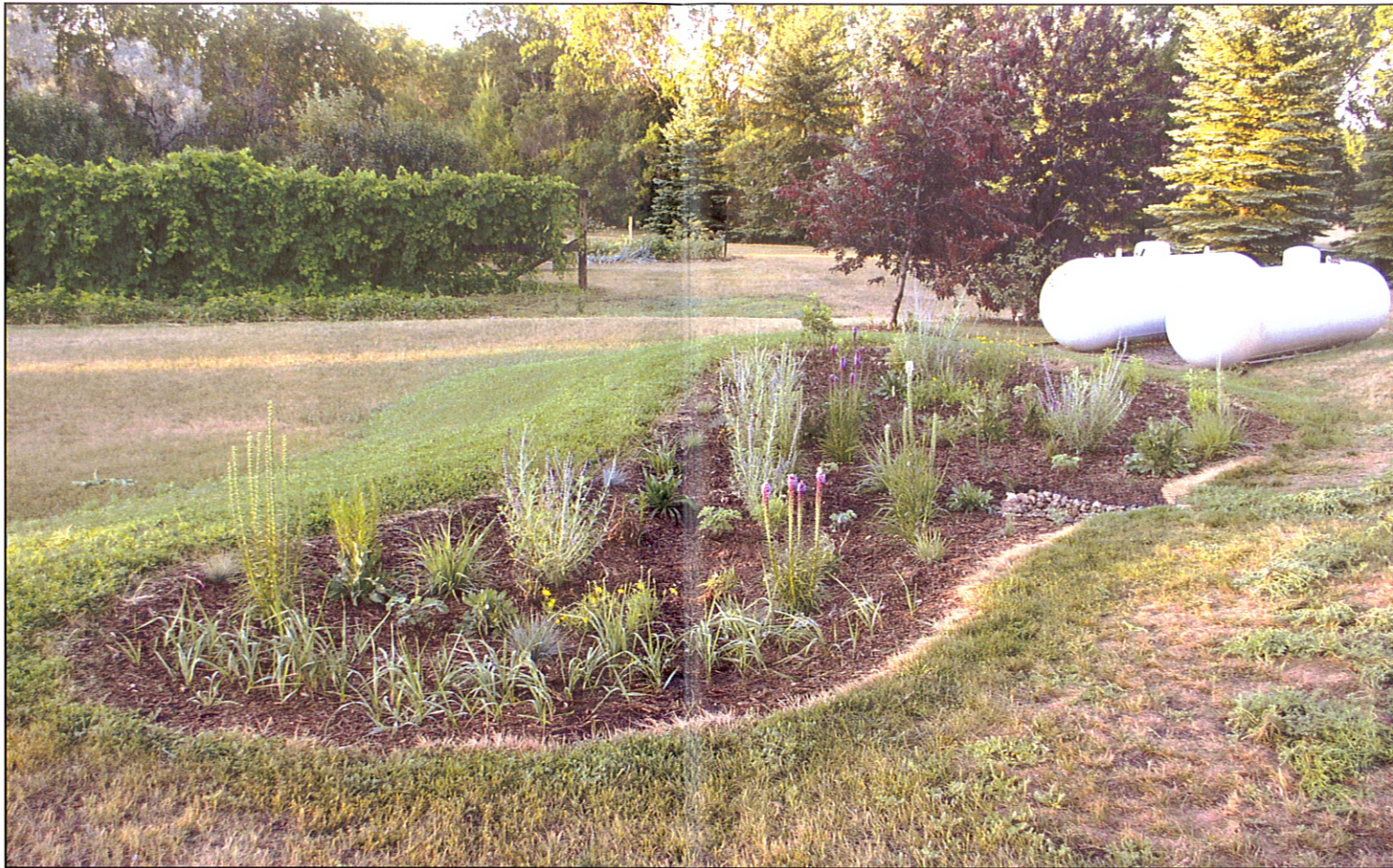
Figure 1. A 200-square foot rain garden blooms just 2 months after construction and planting.