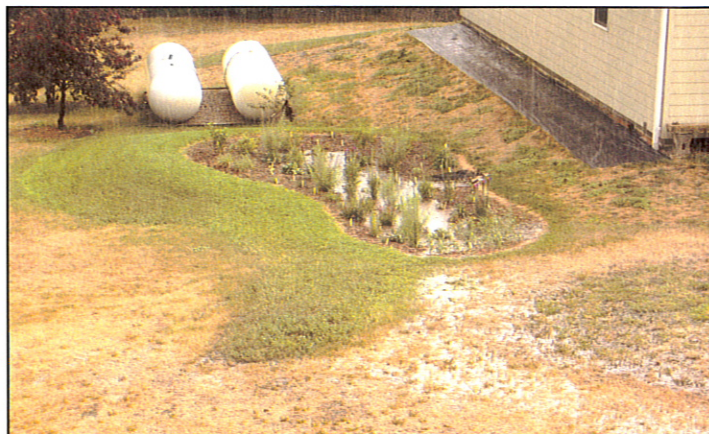
Figure 2. A new rain garden captures roof and yard runoff from a 1/2 inch, 15-minute prairie thunderstorm in July. Note the drought stressed yard outside the rain garden.

A rain garden is a colorful, perennial planting designed to capture and use rain water that may otherwise run off. (Figure 1) It is a garden in a shallow depression. It can be large or small. A rain garden is not a wetland and should not hold water for more than a few hours, or a day at most. It is not a breeding ground for mosquitoes.